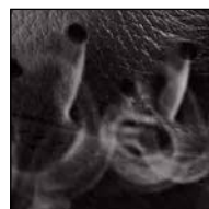
HAIX® Climate System