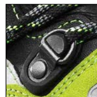
HAIX® 2-Zone Lacing