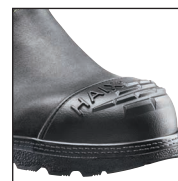
Rubber Toe Cap