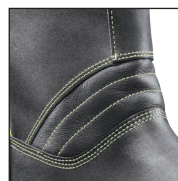
HAIX® AF System