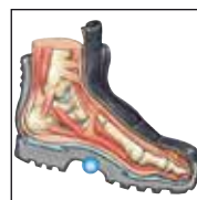
HAIX® AS System