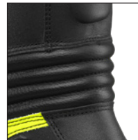
HAIX® Ankle Flex System