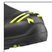
HAIX® High Durability Cap System