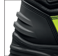
HAIX® Boot Jack