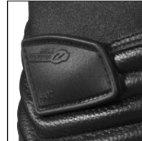
HAIX® Ankle Protector System