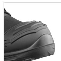
Rubber Toe Cap