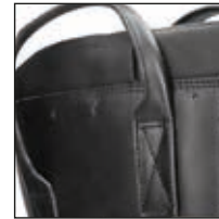
HAIX® Climate System