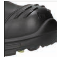
Durable toe cap