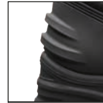
HAIX® Boot Jack