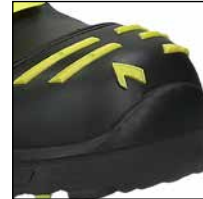
HAIX® High Durability Cap System