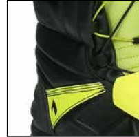
HAIX® AF System