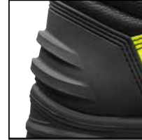
HAIX® Boot Jack