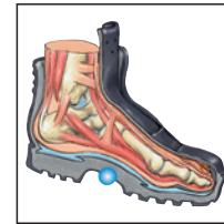
HAIX® AS System