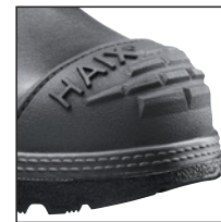
Rubber Toe Cap