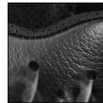
HAIX® Climate System