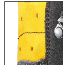
HAIX® Climate Lacing