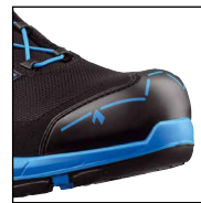
HAIX® Composite Toe Cap