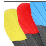
HAIX® Vario Wide Fit System