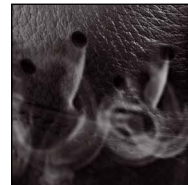
HAIX® Climate System