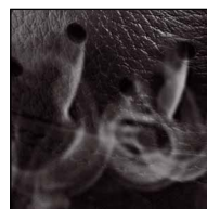
HAIX® Climate System