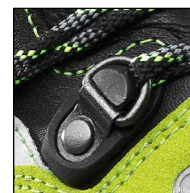
HAIX® 2-Zone Lacing