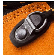
HAIX® 2-Zone Lacing